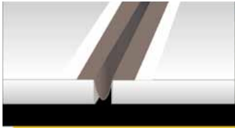
Positioning Mapeband PE 120 in an omega pattern in an expansion joint