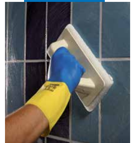
Kerapoxy CQ is emulsified with water, using a Scotch-Brite® pad