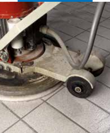
Cleaning the surface with water and single-head rotary machine with special abrasive felt discs, such as "Scotch-Brite®"