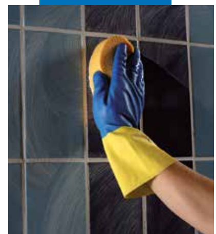
Cleaning and finishing with a hard cellulose sponge