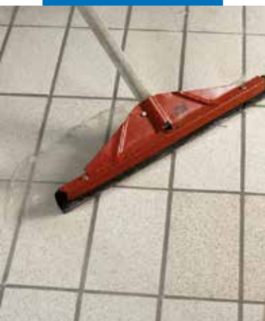
Removing excess liquid using a rubber squeegee