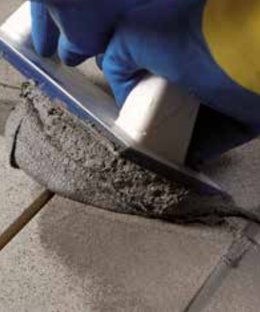
Spreading Kerapoxy CQ using a MAPEI float