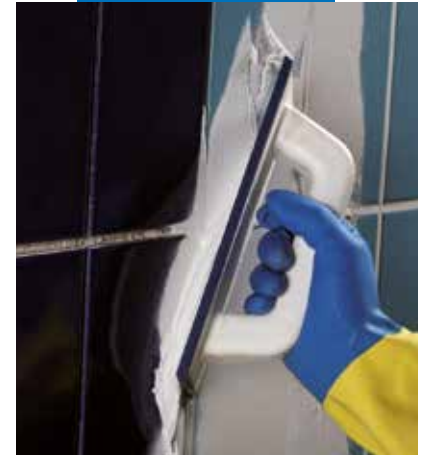
Spreading Kerapoxy CQ on a wall using a MAPEI float